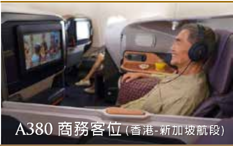
A380 商務客位 (香港-新加坡航段)